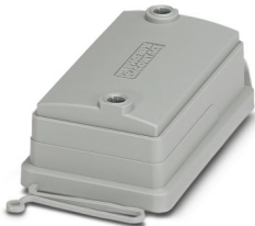
Protective cover B10, with clip locking, protective cover material: PA, height: 31.2 mm, seal: no, with lanyard

Please be informed that the data shown in this PDF document is generated from our online catalog. Please find the complete data in the user documentation. Our general terms of use for downloads are valid.