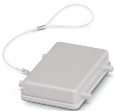
Protective cover D50, for double locking latch, protective cover material: PA, height: 16.5 mm, seal: no, with lanyard

Please be informed that the data shown in this PDF document is generated from our online catalog. Please find the complete data in the user documentation. Our general terms of use for downloads are valid.