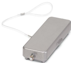
Protective cover B24, for single locking latch, protective cover material: Al, height: 16 mm, seal: no, with lanyard

Please be informed that the data shown in this PDF document is generated from our online catalog. Please find the complete data in the user documentation. Our general terms of use for downloads are valid.