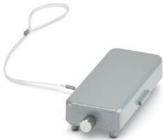
Protective cover B16, for single locking latch, protective cover material: Al, height: 16 mm, seal: no, with lanyard

Please be informed that the data shown in this PDF document is generated from our online catalog. Please find the complete data in the user documentation. Our general terms of use for downloads are valid.