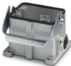
Box mounting base, with single locking latch, with protective cover, height: 100 mm, without screw connection, 2 x Pg36

Please be informed that the data shown in this PDF document is generated from our online catalog. Please find the complete data in the user documentation. Our general terms of use for downloads are valid.