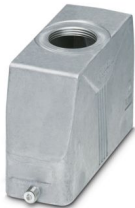
Sleeve housing B24, for single locking latch, material: Die-cast aluminum, salt water resistant, cable outlets: 1, straight, 1x M32, height: 76 mm, cable gland: none, Standard

Please be informed that the data shown in this PDF document is generated from our online catalog. Please find the complete data in the user documentation. Our general terms of use for downloads are valid.