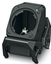
HEAVYCON EVO sleeve housing, plastic, with bayonet flange for EVO screw connection, B10, with double locking latch, height: 60.5 mm, without EVO screw connection

Please be informed that the data shown in this PDF document is generated from our online catalog. Please find the complete data in the user documentation. Our general terms of use for downloads are valid.