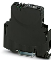
Electronic circuit breaker

Please be informed that the data shown in this PDF document is generated from our online catalog. Please find the complete data in the user documentation. Our general terms of use for downloads are valid.