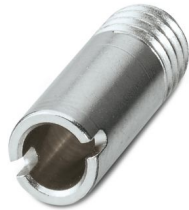
Test plug strip, number of positions: 1, color: silver-colored

Please be informed that the data shown in this PDF document is generated from our online catalog. Please find the complete data in the user documentation. Our general terms of use for downloads are valid.