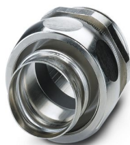
Cable gland made from brass with Pg thread, IP40 protection

Please be informed that the data shown in this PDF document is generated from our online catalog. Please find the complete data in the user documentation. Our general terms of use for downloads are valid.