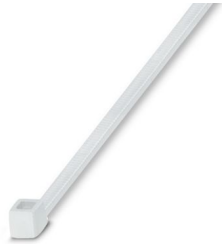
Cable binders for quick and secure bundling, standard version

Please be informed that the data shown in this PDF document is generated from our online catalog. Please find the complete data in the user documentation. Our general terms of use for downloads are valid.