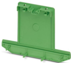
Side element, tall version, for closing both ends of the base element UM-BEFE, for 60 mm wide U-shaped profile cover

Please be informed that the data shown in this PDF document is generated from our online catalog. Please find the complete data in the user documentation. Our general terms of use for downloads are valid.