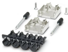
Cable housing for D-SUB-9

Please be informed that the data shown in this PDF document is generated from our online catalog. Please find the complete data in the user documentation. Our general terms of use for downloads are valid.