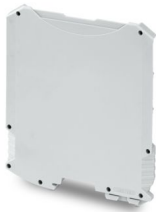
DIN rail housing, Housing half shell (left), tall design, width: 6.3 mm, height: 99 mm, depth: 112.85 mm, color: light gray (similar RAL 7035)

Please be informed that the data shown in this PDF document is generated from our online catalog. Please find the complete data in the user documentation. Our general terms of use for downloads are valid.