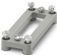
D-SUB adapter plate, for one D-SUB connector, no. of positions 25, housing series HC-D 15...

Please be informed that the data shown in this PDF document is generated from our online catalog. Please find the complete data in the user documentation. Our general terms of use for downloads are valid.