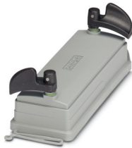
HEAVYCON ADVANCE IP65 protective cover B24, with bayonet locking, with retaining cord, diameter of retaining cord eyelet 3 mm

Please be informed that the data shown in this PDF document is generated from our online catalog. Please find the complete data in the user documentation. Our general terms of use for downloads are valid.