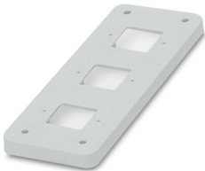
HEAVYCON adapter plate with a reinforced wall, three openings for D7 panel mounting base; type B24 on 3xD7, for panel cutouts of type B24; gray

Please be informed that the data shown in this PDF document is generated from our online catalog. Please find the complete data in the user documentation. Our general terms of use for downloads are valid.