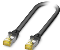
Patch cable, cable length: 2 m, number of positions: 8, 10 Gbps, CAT6 A , connection cross section: AWG 26- 26, Ethernet

Please be informed that the data shown in this PDF document is generated from our online catalog. Please find the complete data in the user documentation. Our general terms of use for downloads are valid.