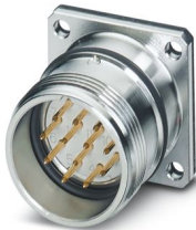
M23, Device connector front mounting, series: RC, straight, shielded: yes, Screw locking mechanism, Flat gasket

Please be informed that the data shown in this PDF document is generated from our online catalog. Please find the complete data in the user documentation. Our general terms of use for downloads are valid.