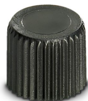
M12 sealing cap for unoccupied M12 plugs of the sensor/actuator cable, flush-type plugs and I/O devices in the field

Please be informed that the data shown in this PDF document is generated from our online catalog. Please find the complete data in the user documentation. Our general terms of use for downloads are valid.