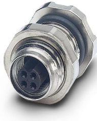
Device connector rear mounting, 4-position, Socket, straight, M5, coding: A, Solder pins

Please be informed that the data shown in this PDF document is generated from our online catalog. Please find the complete data in the user documentation. Our general terms of use for downloads are valid.