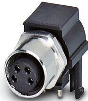
Device connector rear mounting, 4-position, Socket, straight, M8, A-coding, Wave soldering

Please be informed that the data shown in this PDF document is generated from our online catalog. Please find the complete data in the user documentation. Our general terms of use for downloads are valid.