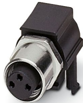
Device connector rear mounting, 3-position, Socket, straight, M8, coding: A, Rear mounting, M8 x 1, Wave soldering

Please be informed that the data shown in this PDF document is generated from our online catalog. Please find the complete data in the user documentation. Our general terms of use for downloads are valid.