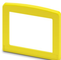
Housing frame, Design element with marking field, color: yellow (similar RAL 1018)

Please be informed that the data shown in this PDF document is generated from our online catalog. Please find the complete data in the user documentation. Our general terms of use for downloads are valid.