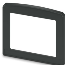
Housing frame, Design element with marking field, color: black (similar RAL 9005)

Please be informed that the data shown in this PDF document is generated from our online catalog. Please find the complete data in the user documentation. Our general terms of use for downloads are valid.