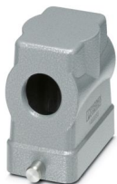
HEAVYCON B10 sleeve housing, for single locking latch, height: 72 mm, with 1 x M32 gland, lateral cable outlet

Please be informed that the data shown in this PDF document is generated from our online catalog. Please find the complete data in the user documentation. Our general terms of use for downloads are valid.