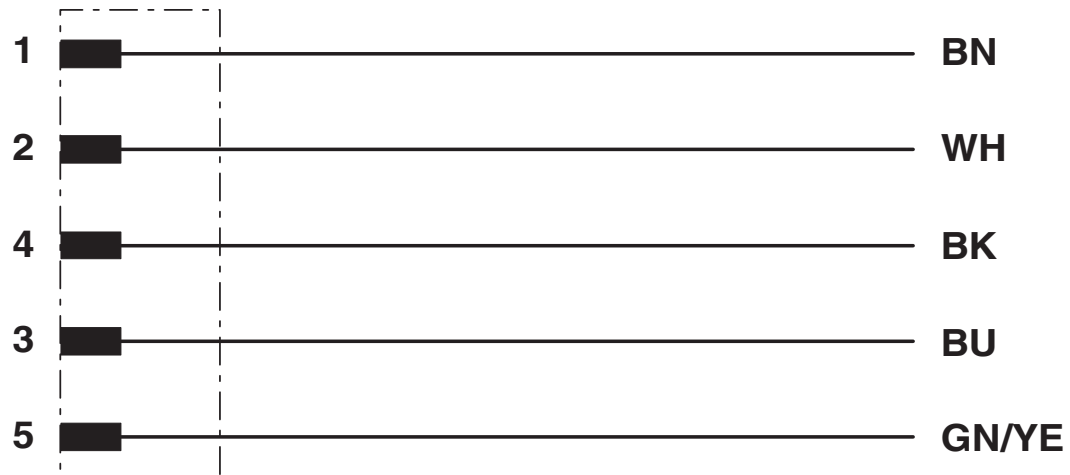
Contact assignment of the M12 plug