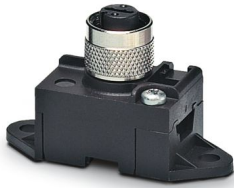
AS-Interface distributor with IP67 protection for one flat-ribbon conductor, with a straight, A-coded, 2-pos. M12 socket

Please be informed that the data shown in this PDF document is generated from our online catalog. Please find the complete data in the user documentation. Our general terms of use for downloads are valid.