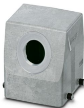
Sleeve housing B32, for double locking latch, material: Die-cast aluminum, salt water resistant, cable outlets: 1, lateral, 1x Pg29, height: 94 mm, cable gland: none, Standard

Please be informed that the data shown in this PDF document is generated from our online catalog. Please find the complete data in the user documentation. Our general terms of use for downloads are valid.