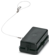
Protective cover B10, for single locking latch, protective cover material: PA, height: 18.5 mm, seal: no

Please be informed that the data shown in this PDF document is generated from our online catalog. Please find the complete data in the user documentation. Our general terms of use for downloads are valid.