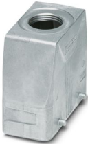
Sleeve housing B16, for double locking latch, material: Die-cast aluminum, salt water resistant, cable outlets: 1, straight, 1x Pg29, height: 76 mm, cable gland: none, Standard

Please be informed that the data shown in this PDF document is generated from our online catalog. Please find the complete data in the user documentation. Our general terms of use for downloads are valid.