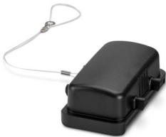
Protective cover B10, for double locking latch, protective cover material: PC, height: 26.3 mm, seal: no

Please be informed that the data shown in this PDF document is generated from our online catalog. Please find the complete data in the user documentation. Our general terms of use for downloads are valid.