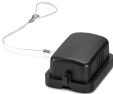
Protective cover B6, for single locking latch, protective cover material: PC, height: 26.3 mm, seal: no

Please be informed that the data shown in this PDF document is generated from our online catalog. Please find the complete data in the user documentation. Our general terms of use for downloads are valid.