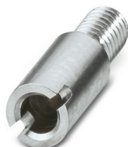
Test plug strip, number of positions: 1, color: silver-colored

Please be informed that the data shown in this PDF document is generated from our online catalog. Please find the complete data in the user documentation. Our general terms of use for downloads are valid.