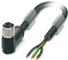
Power cable, 3-position, PUR, black, free cable end, on Socket angled M12, coding: S, Customer version

Please be informed that the data shown in this PDF document is generated from our online catalog. Please find the complete data in the user documentation. Our general terms of use for downloads are valid.