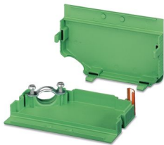
Cable housing, color: green, product range: KGS-MSTB 2,5

Please be informed that the data shown in this PDF document is generated from our online catalog. Please find the complete data in the user documentation. Our general terms of use for downloads are valid.