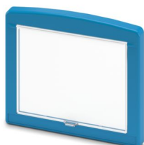
Housing frame, Hinged cover (transparent), color: blue (similar RAL 5015)

Please be informed that the data shown in this PDF document is generated from our online catalog. Please find the complete data in the user documentation. Our general terms of use for downloads are valid.