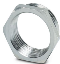
Reducing adapter, connecting thread: Pg21, color: silver-colored, with O-ring

Please be informed that the data shown in this PDF document is generated from our online catalog. Please find the complete data in the user documentation. Our general terms of use for downloads are valid.