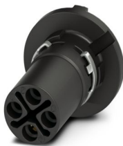
Contact carrier, Universal, 4-position, Socket, straight, M12, S-coding, THR solder connection, Item is lead-free in accordance with RoHS II without Exemption 6c (Pb < 0.1 %)

Please be informed that the data shown in this PDF document is generated from our online catalog. Please find the complete data in the user documentation. Our general terms of use for downloads are valid.