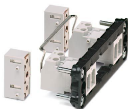
Panel mounting frame, with capacitive PE, for contact insert modules, type 3, number of insert modules 4

Please be informed that the data shown in this PDF document is generated from our online catalog. Please find the complete data in the user documentation. Our general terms of use for downloads are valid.