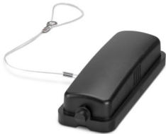
Protective cover B24, for single locking latch, protective cover material: PC, height: 26.3 mm, seal: no

Please be informed that the data shown in this PDF document is generated from our online catalog. Please find the complete data in the user documentation. Our general terms of use for downloads are valid.