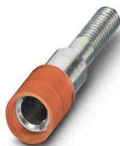
Test plug strip, number of positions: 1, color: red

Please be informed that the data shown in this PDF document is generated from our online catalog. Please find the complete data in the user documentation. Our general terms of use for downloads are valid.