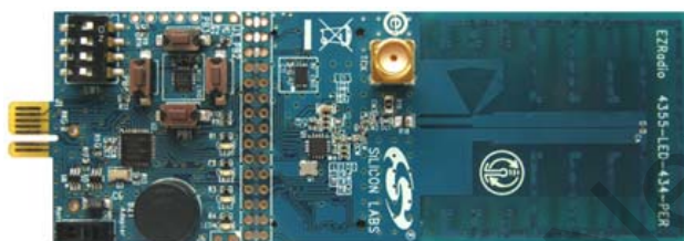
Figure 2. Si4355 RFStick 434 MHz Receiver Board (P/N 4355-LED-434-SRX)