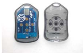
Figure 1. Si4010 Universal Key Fob Board and Plastic Case (P/N 4010-KFOB-434 and MSC-PLPB_1)