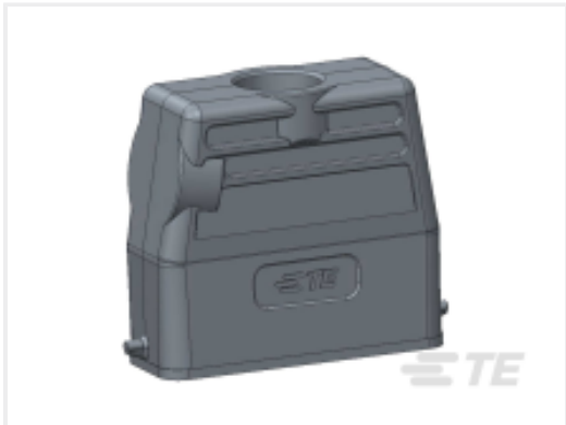
TE Part #T1349160120-000 H16A-TGH-M20