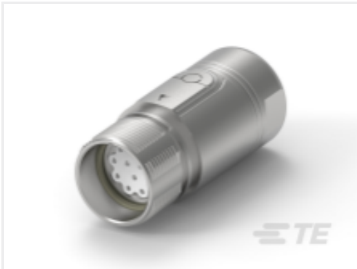
TE Part #AKA012N00410100000 623 EXTENSION, SPEEDTEC