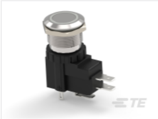
TE Part #2-2364570-8 AVH19 FLT SS LK RNG R&B 24V16A