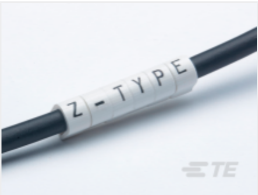
TE Part #CAT-T3437-Z1 Z-Type Push-On Markers