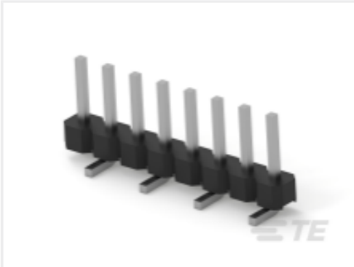
TE Part #2842104-8 8P,2MM,BRK HDR,SRVT,SMD,0.76AU, TR W/CAP