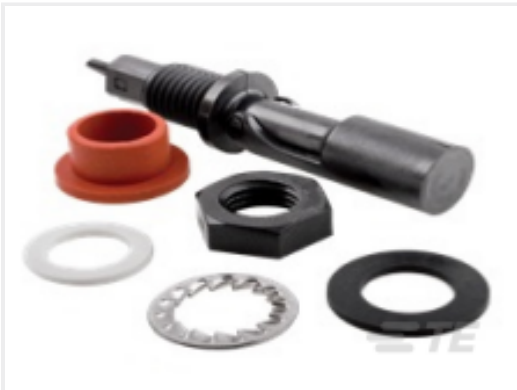
TE Part #80645-000 LS809-51 Liquid Level Sensor