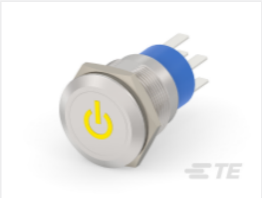
TE Part #6-2213766-9 AV19 DPL 3A POWER LED YELLOW 12V