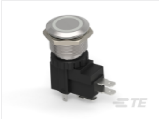
TE Part #1-2364686-5 AVH22 FLT SS MT RNG GRN 24V16A