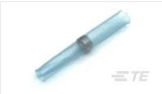
TE Part #625159-000 D-110-35