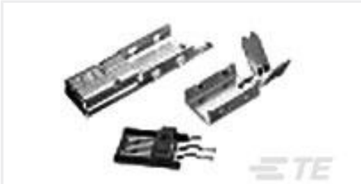
TE Part #1734205-1 MINI USB, TYPE B, PLUG. CABLE-KIT