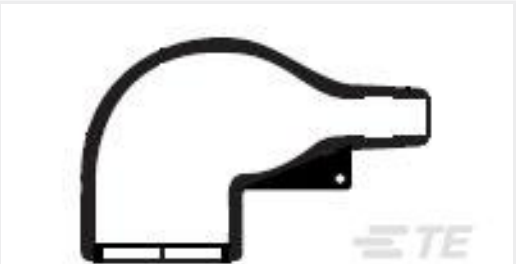
TE Part #373505-000 222K152-100/180-0