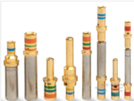
TE Part #38943-16L CONT SOC ASSY