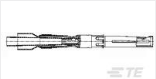
TE Part #601038-000 D-602-55