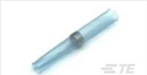
TE Part #625134-000 D-110-40