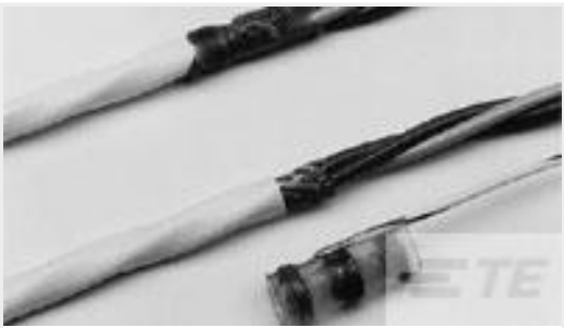
TE Part #481022-000 SO63-4-55-24-90