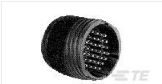
TE Part #206036-3 RECEPT,SZ 17-16,CPC