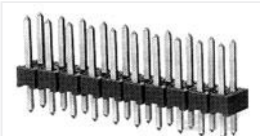
TE Part #828080-6 6P MOD2 STIFT LEI