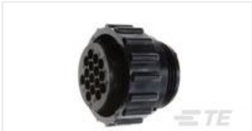
TE Part #206037-1 CPC PLUG ASSEMBLY SIZE 17-16