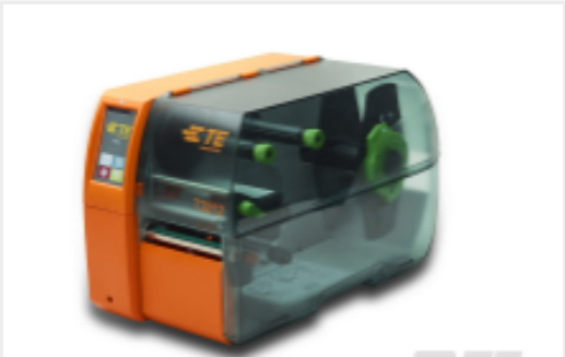
TE Part #1-2186500-1 T3212-PRINTER