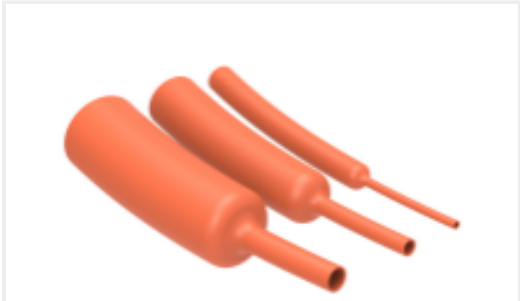
TE Part #CAT-HST-CGPT1 CGPT 2:1 Heat Shrink Tubing