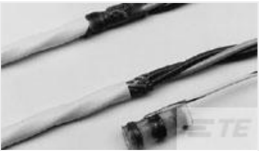
TE Part #599556-000 CWT-5