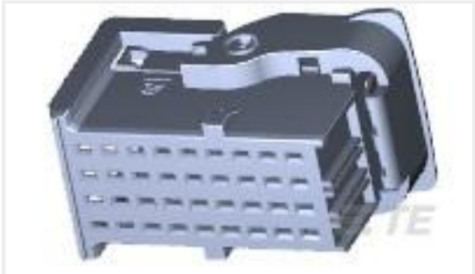
TE Part #1-1718485-4 CARRIER FOR RECEIPT INSERTS 36 POS