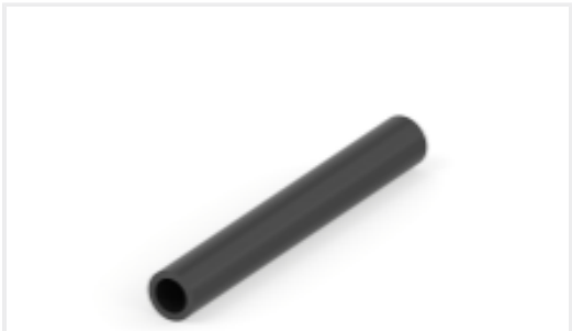
TE Part #CAT-HST-ZH100 ZH-100 Heat Shrink Tubing