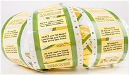
TE Part #F93116-000 HX-SCE-2.5K-6.4-50-S1-4