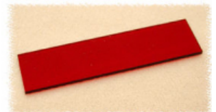
Infrared panel available (special order).