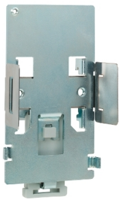
plate for mounting on symmetrical DIN rail, Altivar, for variable speed drive, size 1