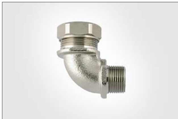
HeliaGuard PSRSC-90FMCSS 90° Elbow Compression Fitting.